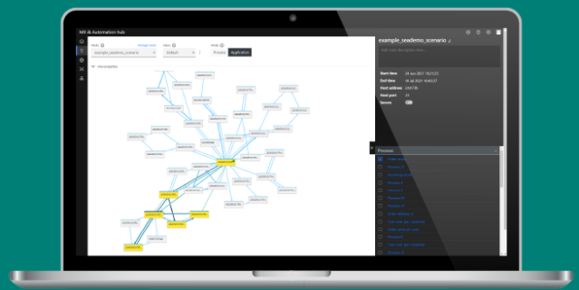
Figure 2: Click through to see all the workflows or highlight a particular workflow and its touch points within the application